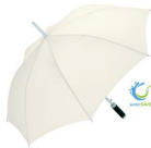
natural white wS